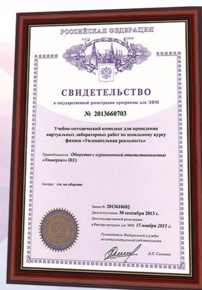
State certificate for "Exciting Reality" trademark property