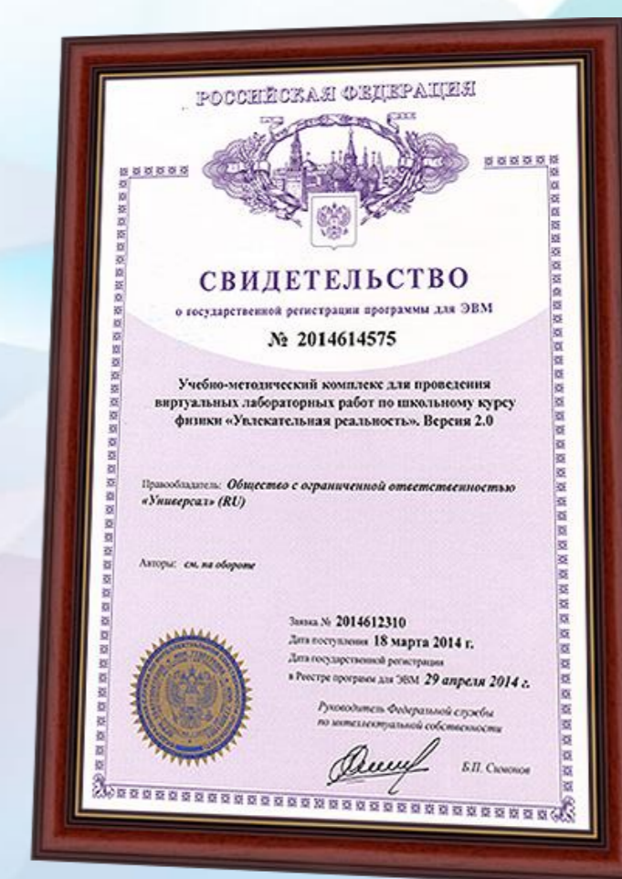
State certificate for "Exciting Reality" trademark property