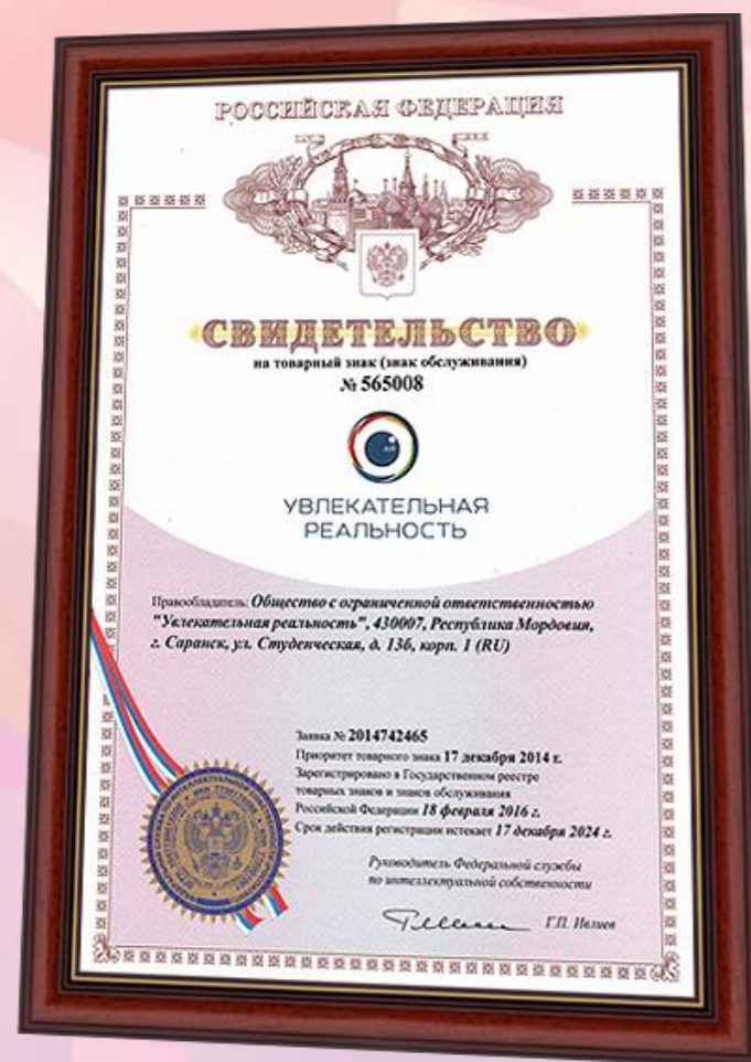
State certificate for "Exciting Reality" trademark property